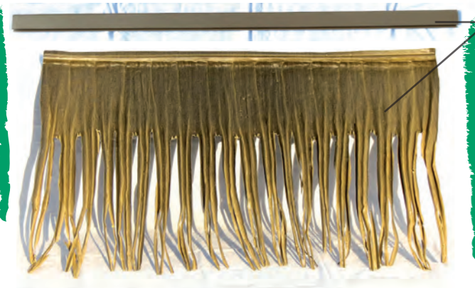
ALOHA or BORA BORA thatch (Palmex leaves + fixing rails included)

- to be screwed onto the structure beams using our patented railing system