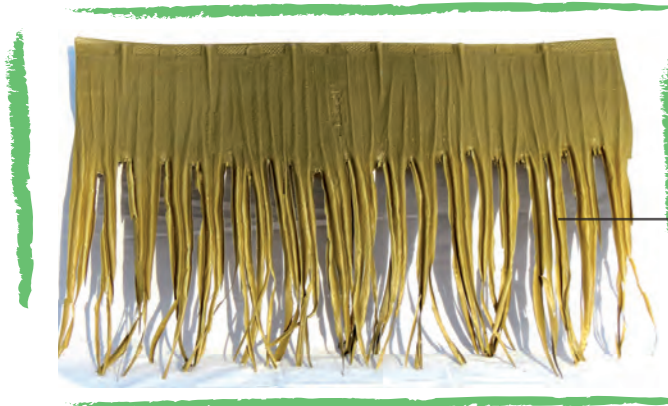
RIO or DOMINGO thatch (Palmex leaves solely)

- to be screwed onto the structure beams using our patented railing system