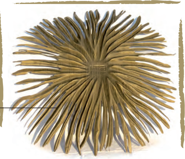
ROUND TOP CAP

- provide a high velocity wind resistance. Use 2 clips per leaf